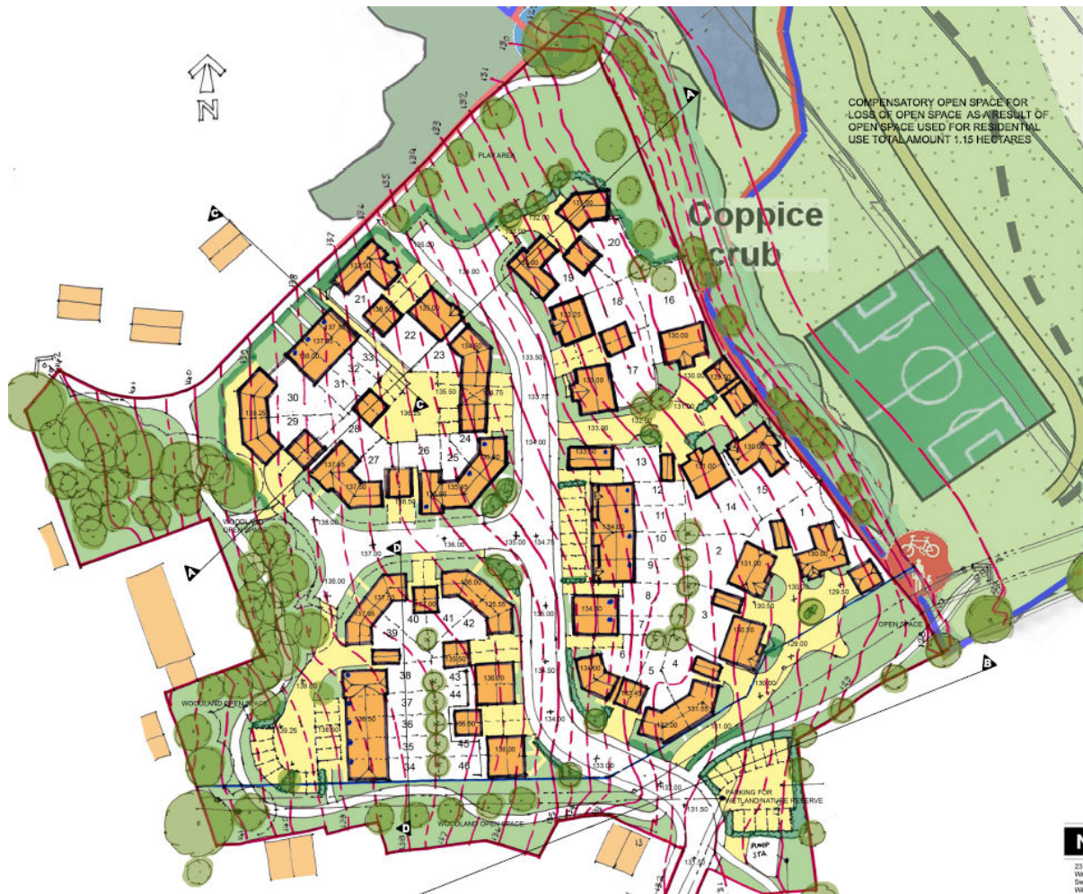
Illustrative Site Layout